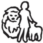
(20) COMMUNITY OF CHRIST