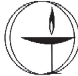
(8) UNITARIAN CHURCH (Flaming Chalice)