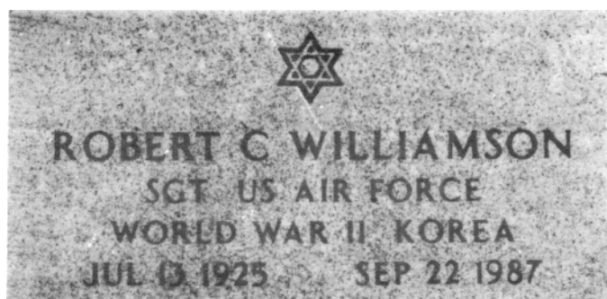
LIGHT GRAY GRANITE OR WHITE MARBLE

This grave marker is 24 inches long, 12 inches wide, and 4 inches thick. Weight is approximately 130 pounds. Variations may occur in stone color; the marble may contain light to moderate veining.