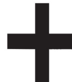
(14) GREEK CROSS