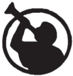
(11) MORMON-ANGEL MORONI