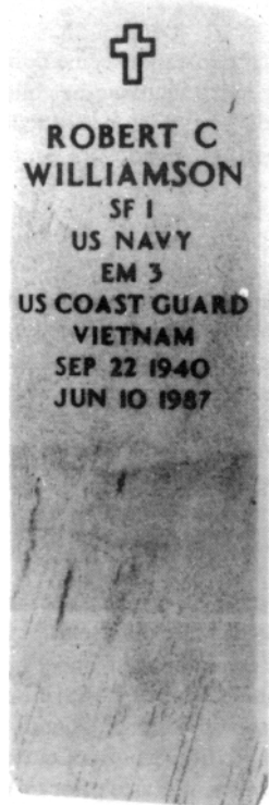
UPRIGHT HEADSTONE WHITE MARBLE OR LIGHT GRAY GRANITE

This headstone is 42 inches long, 13 inches wide and 4 inches thick. Weight is approximately 230 pounds. Variations may occur in stone color, and the marble may contain light to moderate veining.